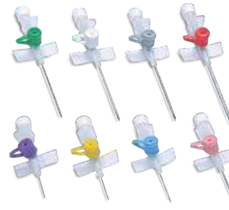
With Port & With Wings