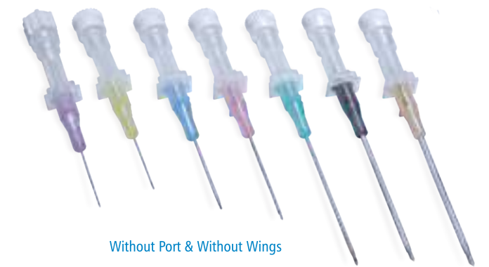
Without Port & Without Wings