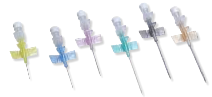
Without Port & With Wings